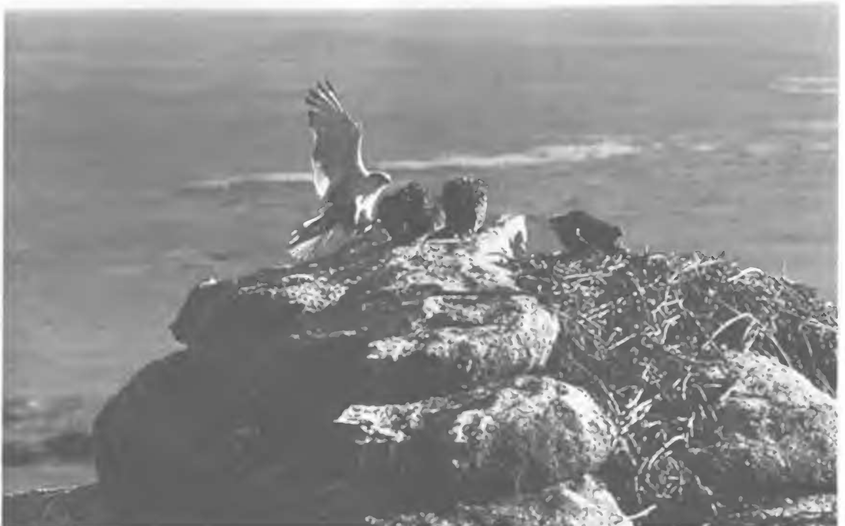
Figure 3. A nest on a short, broad, unshaded pillar in southeastern Mongolia.

Dementiev and Gladkov (1951) previously reported a Saker Falcon nest in an elm tree ( Ulmus sp.) in Mongolia. We found six instances of Saker Falcons using small elms in southeastern Mongolia. These were 2.7–4.0 m above the ground in elms ranging from 4.9–8.5 m tall. All of these were stick nests probably built by either Black Kites or Upland Buzzards. All but one tree provided a closed canopy, shading the nest.